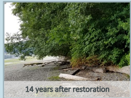
14 years after restoration

Armor removal and restoration at Seahurst Park, a site of longer-term monitoring as highlighted in the press .