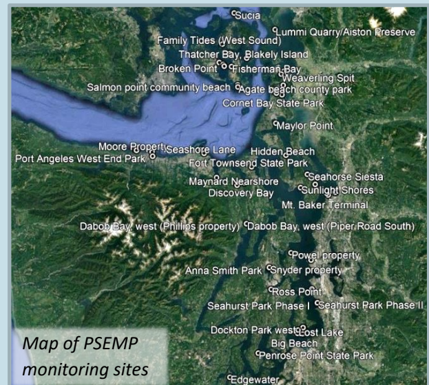
Map of PSEMP monitoring sites

Summary of Monitoring Efforts The Puget Sound Ecosystem Monitoring Program (PSEMP) Nearshore work group recently compiled a list of sites that have been restored and monitored since 2005. The focus was on sites where shoreline armor has, or will be removed, and also included techniques from the Marine Shoreline Design Guidelines (MSDG) and Your Marine Waterfront : sediment nourishment, log placement, and vegetation planting. The list details 54 sites, of which 38 had armor removed as of February 2020, totaling 21,132 feet of armor removed. 26 different groups helped with monitoring efforts, a striking demonstration of the participation breadth across Puget Sound. Further information on armor removal can be found at the Shoreline Armoring Puget Sound Vital Sign , and Ecology's web app for soft shore projects .