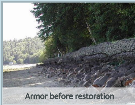
Armor before restoration

Nearly one third of Puget Sound's shorelines are armored (e.g., seawall, bulkhead, riprap). Armoring has documented negative impacts on the flora and fauna that benefit from healthy intertidal beaches. Recent beach restoration efforts have focused on removing armor to recover natural function. Through regular monitoring, we can determine the effectiveness of these restoration efforts and their value to the nearshore ecosystem, applying what we learn to future management scenarios.