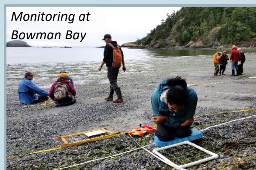
Monitoring at Bowman Bay